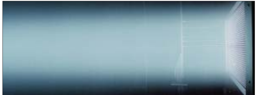
A HiPEP thruster undergoes wear testing at NASA Glenn.

Princeton University leads a NASA-funded effort to develop ALFA 2 , a high-power lithium-fed magnetoplasmadynamic (MPD) thruster that can operate at 250 kW with an I_{sp} of 6,000 sec and